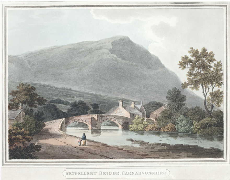
FIG. 1. MARY SMIRKE, 'BETGELLERT BRIDGE, CARNARVONSHIRE', AQUATINT ENGRAVING (C. 1808), NATIONAL LIBRARY OF WALES.

IN MARY SMIRKE'S 'BETGELLERT BRIDGE' (Figure 1), a woman in a blue cloak leads a small child by the hand. Backs to the viewer, they are heading southeast along the bank of the River Colwyn in Beddgelert, in the foothills of Snowdon. It's a summer scene: the trees are in full leaf, the river looks low, and sunlight throws shadows behind the two figures. The copper-rich bulk of Mynydd Sygun rises sharply ahead of them.